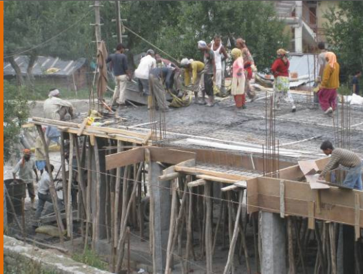
A concrete pour Karen witnessed in India!

www.eco-style.com.au e:mail@eco-style.com.au p: (03) 6234 6077 5 Mathers Lane GPO Box 37, Hobart, 7001